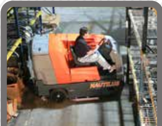
Read & React Maneuverability