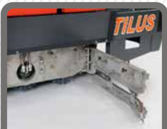
Heavy Duty Stainless Steel Components